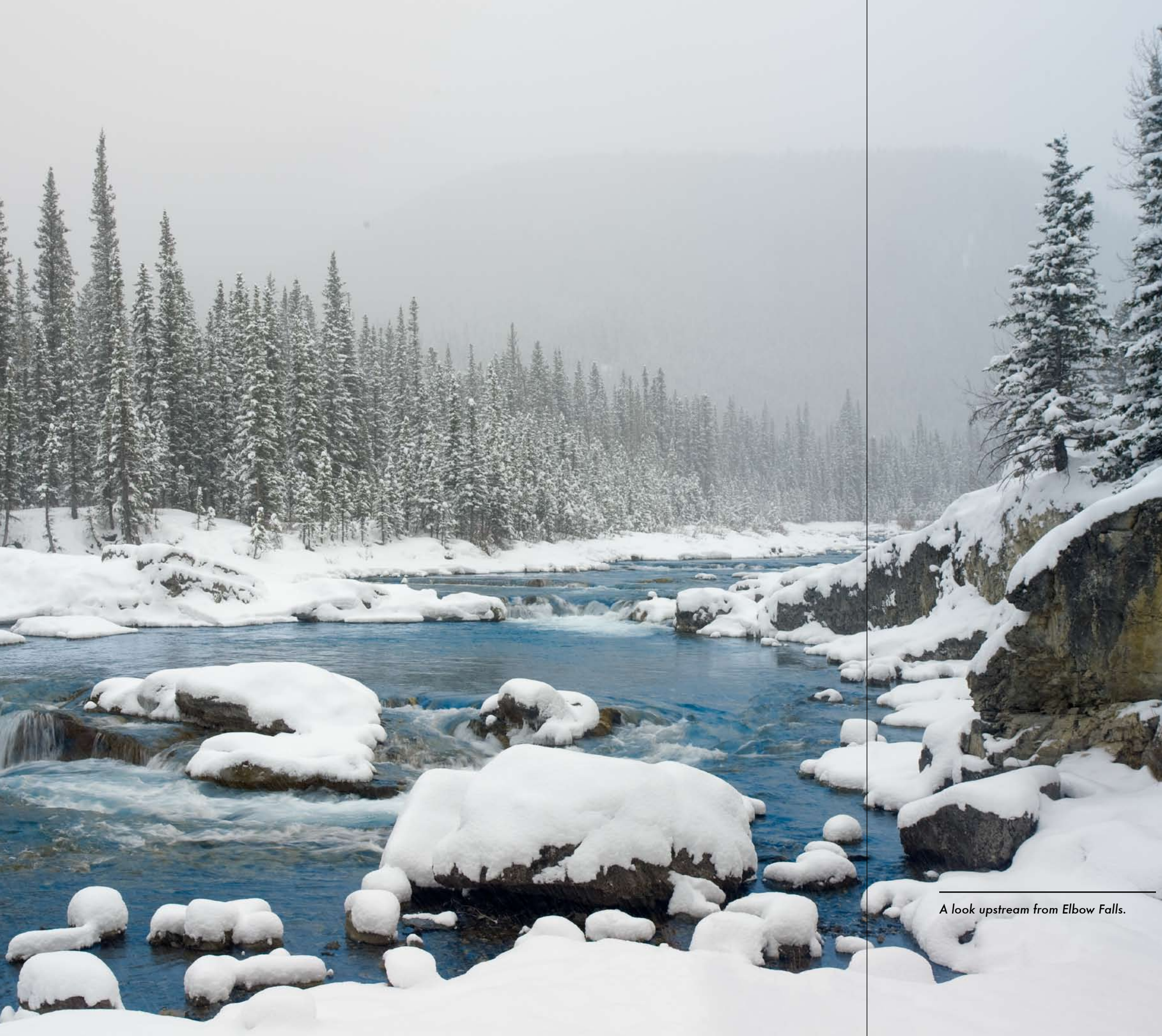
A look upstream from Elbow Falls.