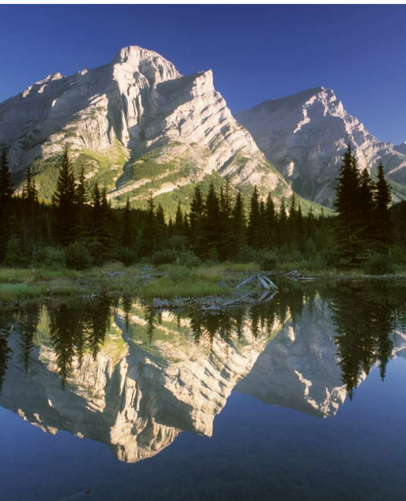
The classic mountain scene of Mount Kidd reflecting in the pools is wonderful to photograph in any season.

Darwin Wiggett is a well-known Canadian outdoors photographer, with numerous calendars, books and magazines published worldwide.