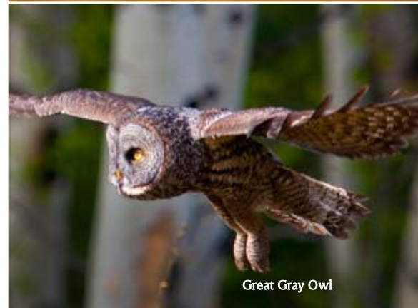
Great Gray Owl