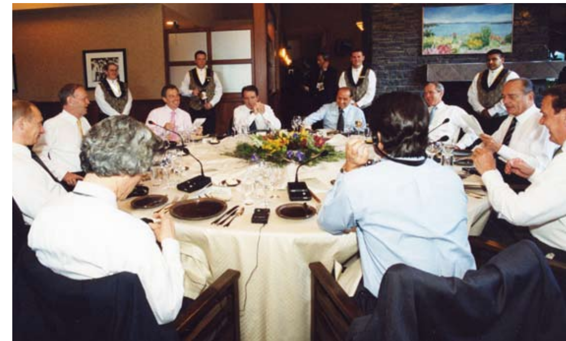
Both G8 photographs by Diane Murphy of the Office of the Prime Minister of Canada, courtesy of Kananaskis Country Golf Course.